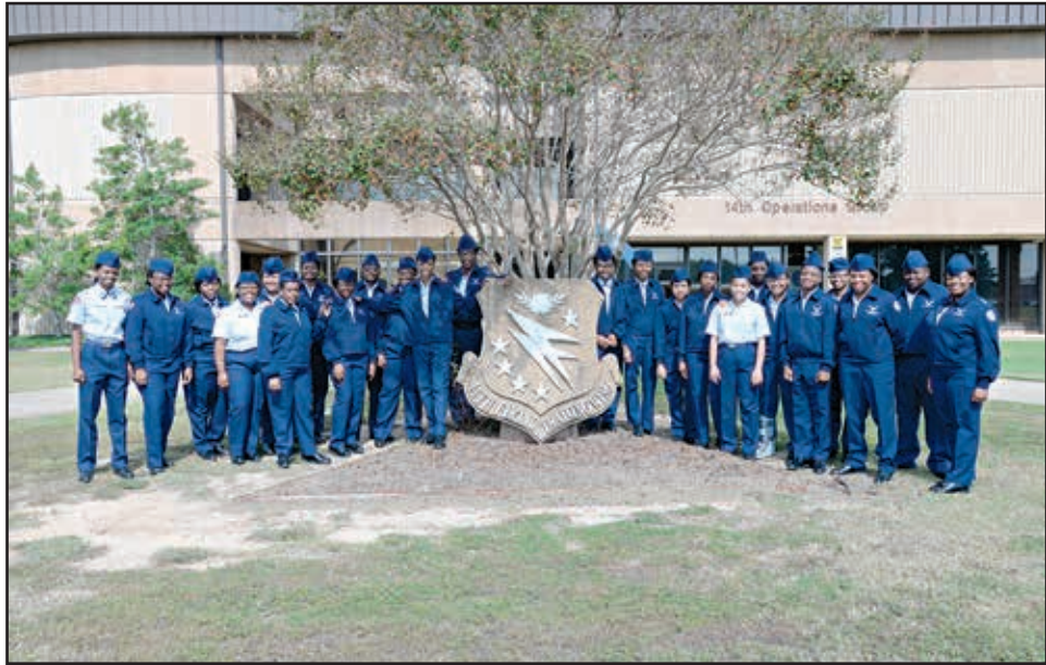
Twenty-four students from the Noxubee High School Air Force Junior Reserves Officer Training Corps stand in front of the 14th Operations Group Oct. 11, 2017, on Columbus Air Force Base, Mississippi. The students toured the Aircrew Flight Equipment office, L3 maintenance and flew a T-1A Jayhawk simulator.

9 a.m.-4 p.m. Oct. 20, and it includes the grand opening of the Beauty Salon. The salon's hours will be Tuesday-Friday from 9 a.m.-5 p.m., Saturday 9 a.m.-6 p.m. and will be closed Sundays and Mondays.