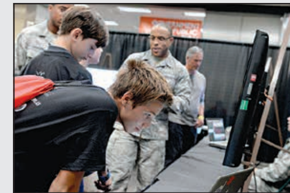
Airmen from the 14th Communications Squadron talk with a group of students Oct. 4, 2017, during the Imagine the Possibilities Career Expo at the BancorpSouth Arena in Tupelo, Mississippi. The expo, hosted by the CREATE Foundation, showcased a multitude of career opportunities for more than 7,000 eighth grade students. The expo took place Oct. 3-5, and had Airmen from Columbus Air Force Base, Mississippi, from various pathways and careers explain their missions and lifestyle.