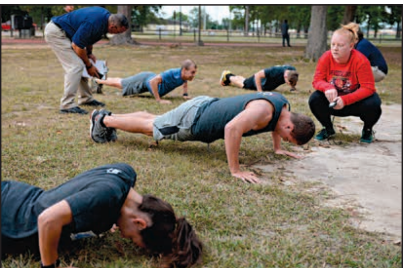
Airmen complete their qualification for the Alpha Warrior competition Oct. 2, 2017, on Columbus Air Force Base, Mississippi. Columbus AFB will be sending seven members to compete in the Alpha Warrior course at Hurlburt Field, Florida, they will be trying to complete the course in the fastest time to reach the number one spot in this year's event.