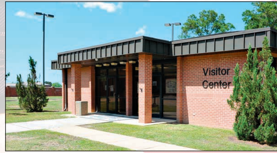
The 14th Security Forces Squadron runs the Visitor Center outside the main gate of Columbus Air Force Base, Mississippi, where base passes and more are provided. The hours of operation are 7:30 a.m. - 4:30 p.m. Monday-Friday, and is closed on weekends, federal holidays, and at noon every third Thursday of the month. For more information, call 434-3161.