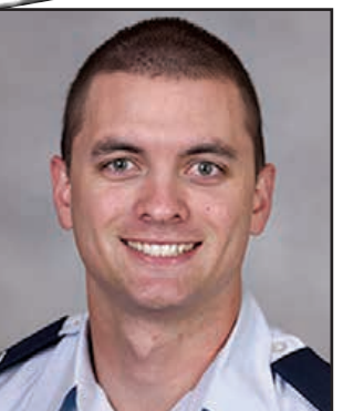
Anaheim, California C-17