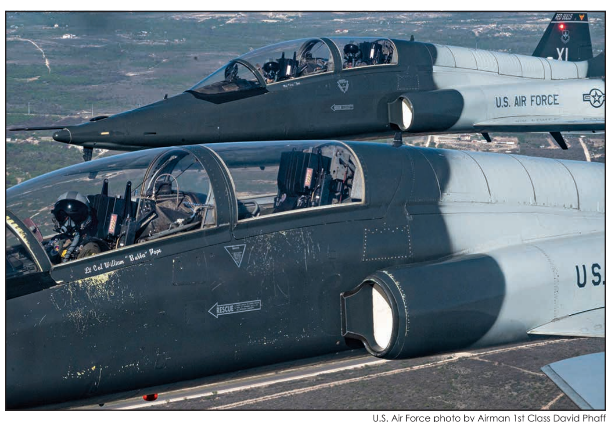
A standard training T-38 flight on Apr. 07, 2021 at Laughlin Air Force Base Texas. The T-38 is the standard aircraft for training pilots who are tracking in the fighter aircraft.