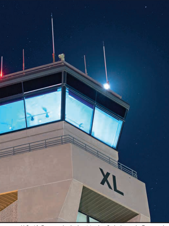
Ultra-violet lights decontaminate the air traffic control tower to mitiagte the spread of COVID-19 after night operations February 20. 2021 at Laughlin Air Force Base. The 47th Operations Support Squadron supported a late-night delivery of relief supplies from the Texas Air National Guard in the wake of Winter Storm Uri.

A six-ship dissimilar formation consisting of two T-1A Jayhawks, two T-38 Talons, and two T-6A Texan II aircrafts from Laughlin Air Force Base, Texas, practice advanced maneuvering May, 2, 2021. Instructor pilots from the 434th, 87th and 85th Flying Training Squadrons demonstrated the flying proficiency all Air Force student pilots receive during their 52-week Specialized Undergraduate Pilot Training before being assigned to their operational career airframe