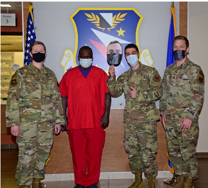
Medical Group Laboratory Services