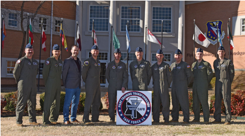
Operations Group Task Force 14