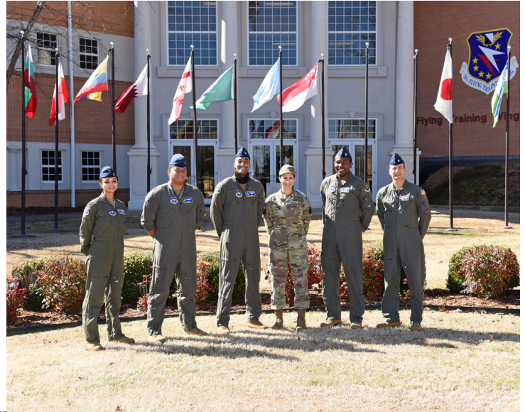
Mission Support Group 14 CES/CEN/Engineering Flight