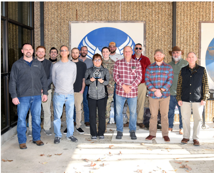
Medical Group 14 Diagnostics & Therapeutics