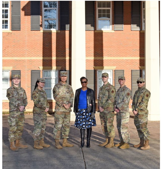
Mission Support Group Base Operations Services Support