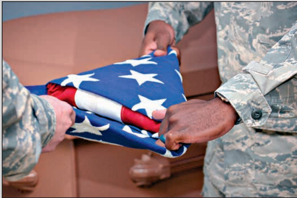
U.S. Air Force photo by Airman 1st Class Beaux Hebert Columbus Air Force Base Honor Guardsmen practice folding the American flag into the traditional tri-fold Sept. 12, 2017, on Columbus Air Force Base, Mississippi. Guardsmen need to ensure the flag is folded neatly in order to present it to the family of a deceased veteran.

Airman 1st Class Beaux Hebert 14th Flying Training Wing