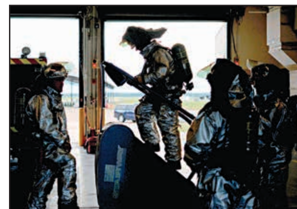
Four 14th Civil Engineer Squadron Fire Protection Airmen climb stairs Sept. 11, 2017, on Columbus Air Force Base, Mississippi, in honor of fallen firefighters. The firefighters climbed 50 stairs and swapped until they completed 341 steps in honor of the 341 fallen firefighters who sacrificed their lives during the 9/11 terrorist attacks.