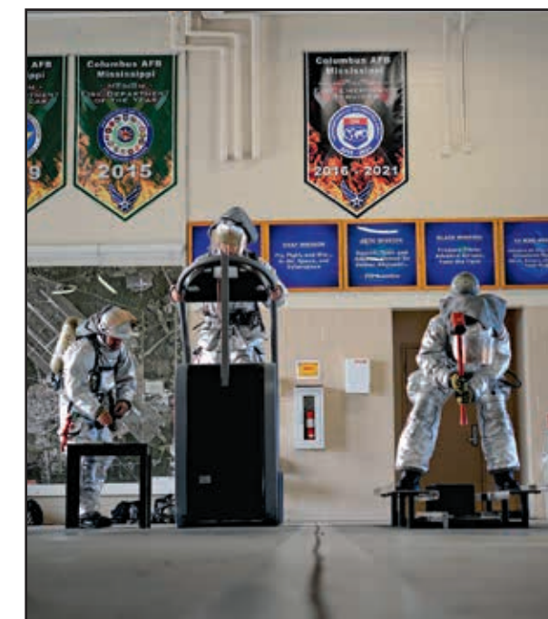
Three 14th Civil Engineer Squadron Fire Protection Airmen perform exercises Sept. 11, 2017, on Columbus Air Force Base, Mississippi, in honor of fallen firefighters. They performed multiple exercises and allowed other service members to do stair climbs in honor of the fallen firefighters who died during the 9/11 terrorist attacks.

Visit www.columbus.af.mil to learn about Columbus AFB agencies and other important information.