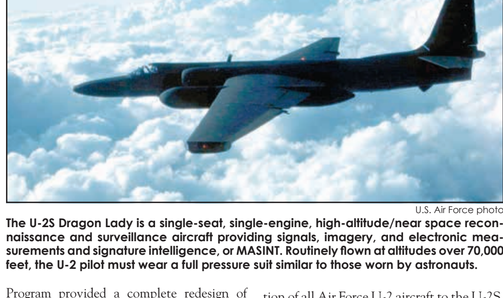
naissance and surveillance aircraft providing signals, imagery, and electronic measurements and signature intelligence, or MASINT. Routinely flown at altitudes over 70,000

The U-2 also carries a signals intelligence packages: electro-optical infrared camera, wet film can be transmitted in near real-time erture radar, signals intelligence, and net-