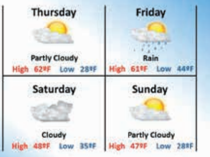
Forecast provided by the 14th OSS Weather Flight