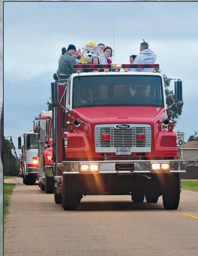
Sparky the Firedog and friends wave at Columbus Air Force Base Airmen and their families during the Fire Prevention Week parade Oct. 3 on Columbus Air Force Base, Mississippi. The parade kicked off the start of Fire Prevention Week events which included an Open House, a live burn, an auto extrication demonstration, a base expo at the Base Exchange and Sparky reading to children at the Youth Center.