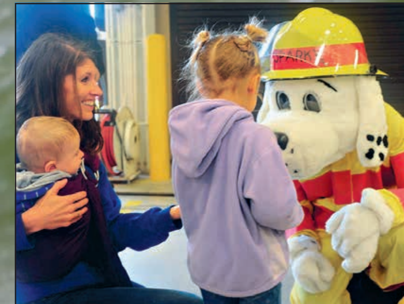
Sparky the Firedog interacts with children at the Fire Prevention Week Open House Oct. 3 on Columbus Air Force Base, Mississippi. The Open House took place right after the parade and featured an auto extrication demonstration and a live burn.